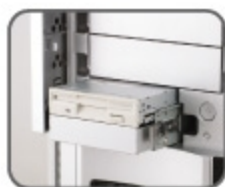
4 Removable 3.5" bays cage (drives not included)