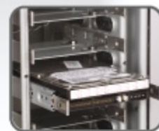
5 Removable HDD trays with shock absorption