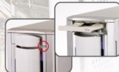
1 Flip-open cover for optical devices. By pushing the open/close button to eject & close the optical device