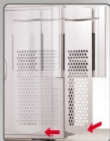
8 Sliding front bezel The front bezel can be opened and slid along the side panel.