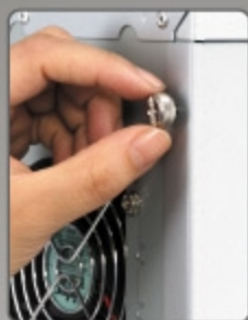
6 Thumb screws