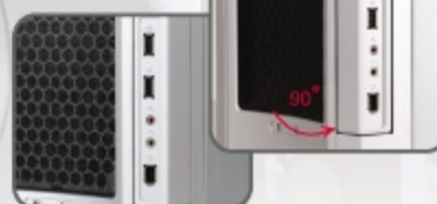
2 Revolving I/O connectors The front connectors can be moved between the front and the side of the Nitro AX. 2x USB2.0 1x IEEE1394 1x Line output 1x Microphone input.