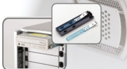
3 Sliding 5.25" bay rails (drives not included)